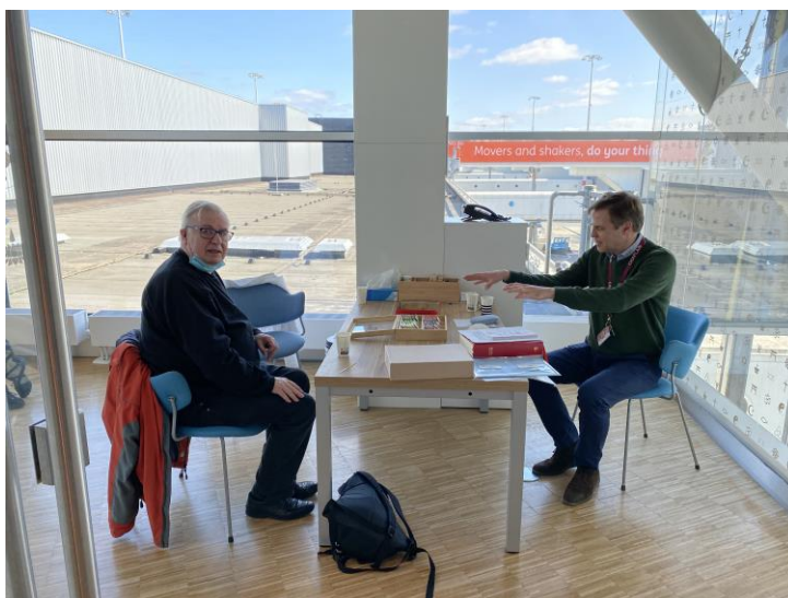
(Chaplains on call)

Schiphol has grown rapidly in recent years and with that the number of specific calls for chaplains assistance. In 2003, there were just 113 calls that required an average time of 2.19 hours each. In 2021 an even further Covid-increase to 435 calls with an average time of about 5.30 hours each was observed.